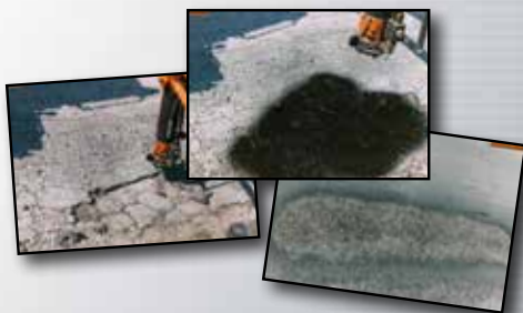
Spray Injection Patcher Process