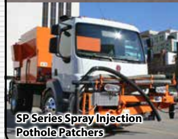
SP Series Spray Injection Pothole Patchers