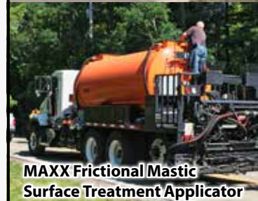
MAXX Frictional Mastic Surface Treatment Applicator