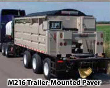
M216 Trailer-Mounted Paver