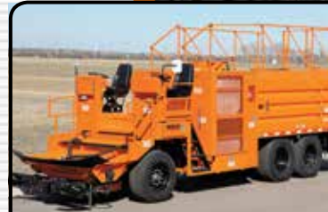
M1 Series Continuous Pavers