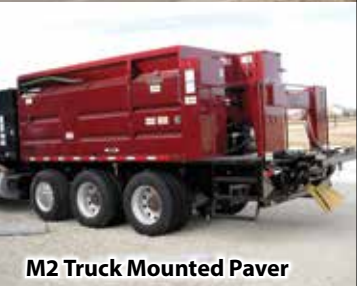
M2 Truck Mounted Paver