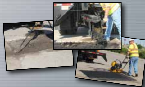
All-In-One Patching Process