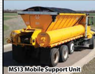
MS13 Mobile Support Unit