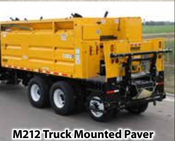
M212 Truck Mounted Paver