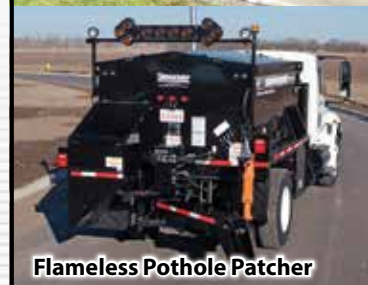
Flameless Pothole Patcher